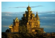
5 endangered tourist treasures