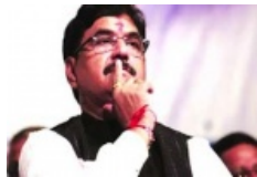
Post-mortem report reveals new theories behind Gopinath Munde's death