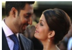
Shocking new revelation - Abhishek to divorce Aishwarya Rai? (video)