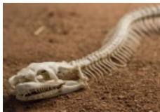
Know about the deadliest place in the world