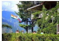
A new Russian tourist season in India