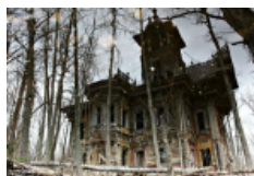
7 Creepiest places that can give you chills